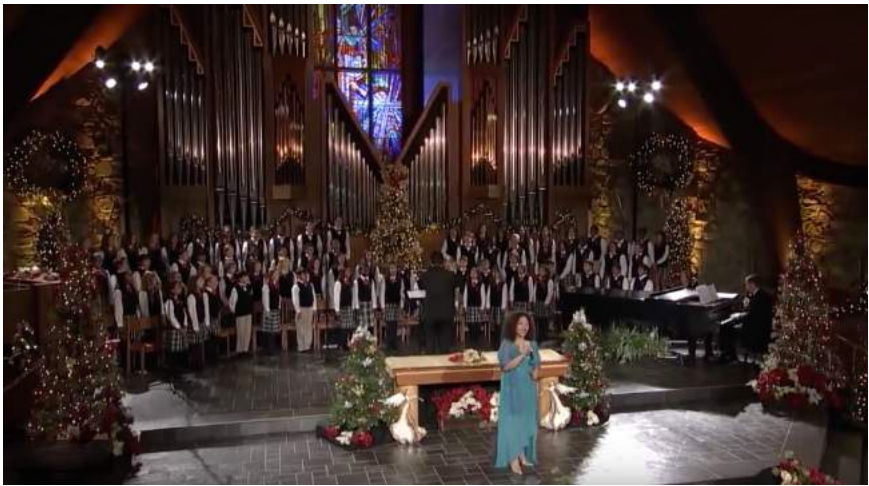
Voice of Prophecy television special on the ABC network.

Oh my, how we have fallen. We think we are witnessing to bring people in, when in fact at the time of Christmas and Easter, those are the only two times of the year that someone would go to their own church. Why would God send anyone into your church's Baal worship as a visitor? Can anyone tell anymore that this is part of a peculiar set of people?